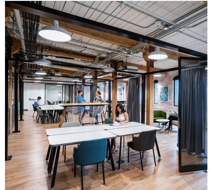
Top: Lightweight, easily-moved seating allows user to configure their space based upon their needs at the moment.